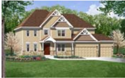
York - B • 3,039 sq. ft.