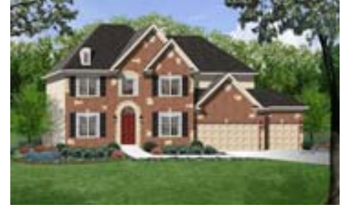
York - C • 3,039 sq. ft.