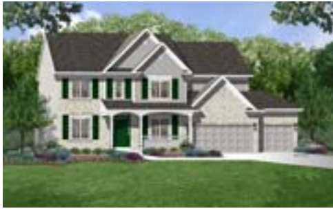
York - A • 3,039 sq. ft.