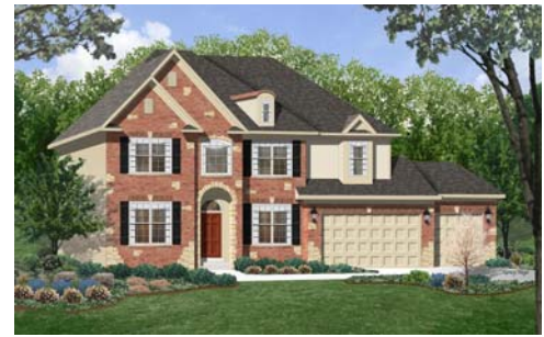
Windsor - C • 3,016 sq. ft.