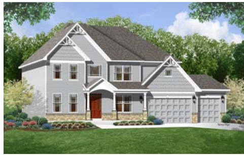
Windsor - B • 3,016 sq. ft.