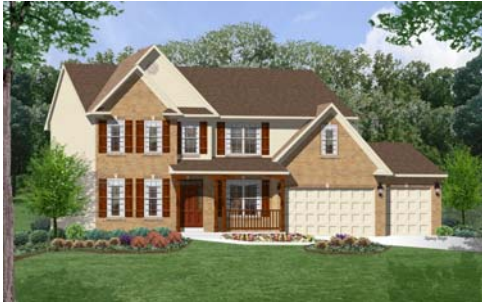
Windsor - A • 3,016 sq. ft.