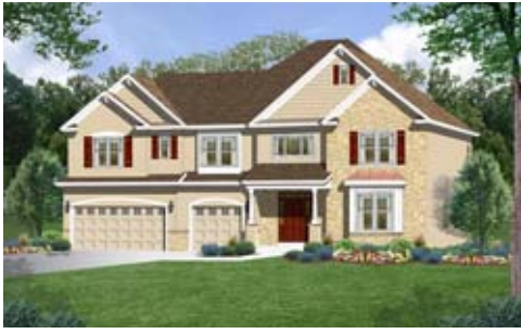
Willow - A • 4,315 sq. ft.