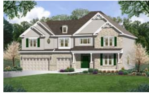
Willow - B • 4,217 sq. ft.