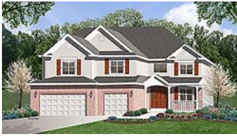
Williamsburg - A • 3,323 sq. ft.