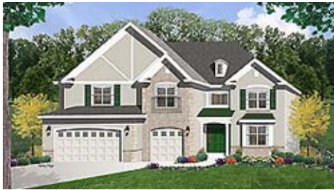
Williamsburg - C • 3,441 sq. ft.