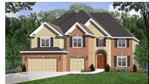
Williamsburg - D • 3,421 sq. ft.