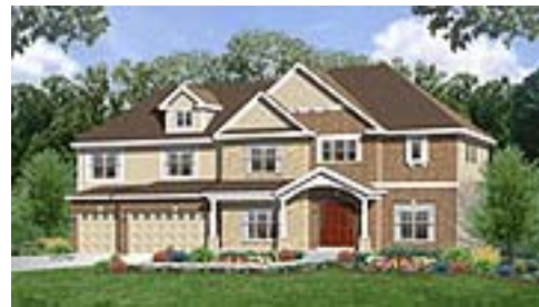
Williamsburg - B • 3,434 sq. ft.