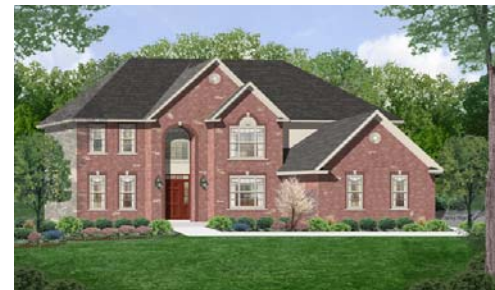
Sycamore - F • 3,659 sq. ft.