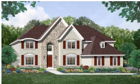
Sycamore - D • 3,603 sq. ft.