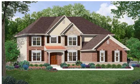
Sycamore - E • 3,610 sq. ft.