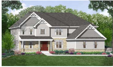
Sycamore - B • 3,681 sq. ft.