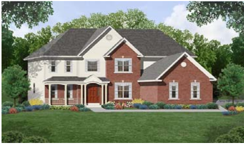
Sycamore - A • 3,600 sq. ft.