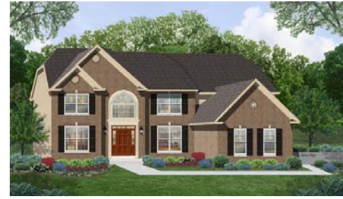
Sycamore - C • 3,613 sq. ft.