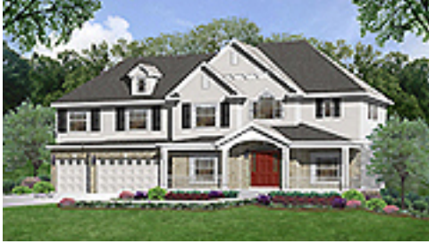
St. James III - A • 3,712 sq. ft.