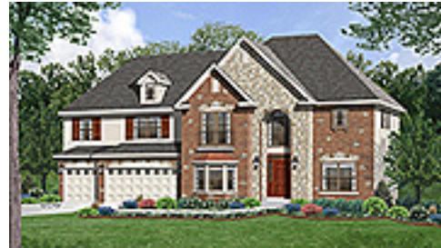
St. James III - D • 3,712 sq. ft.