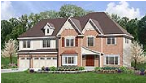
St. James III - C • 3,712 sq. ft.