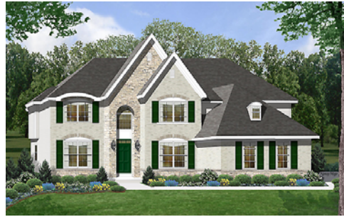
Maple - D • 3,903 sq. ft.