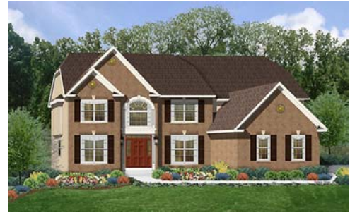
Maple - C • 3,950 sq. ft.