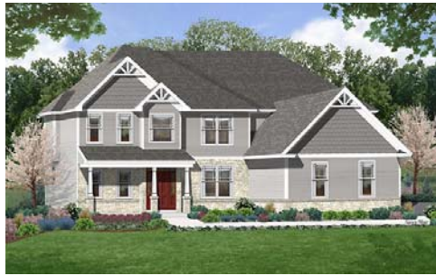
Maple - B • 3,908 sq. ft.