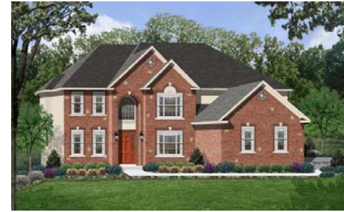
Maple - F • 3,902 sq. ft.