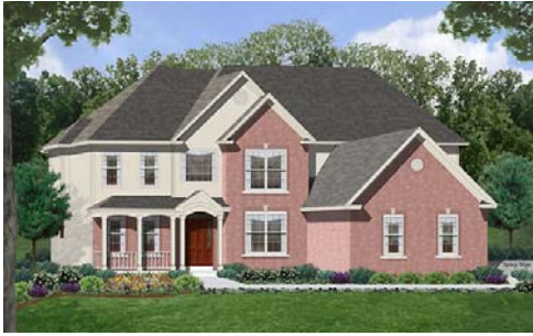
Maple - A • 3,851 sq. ft.