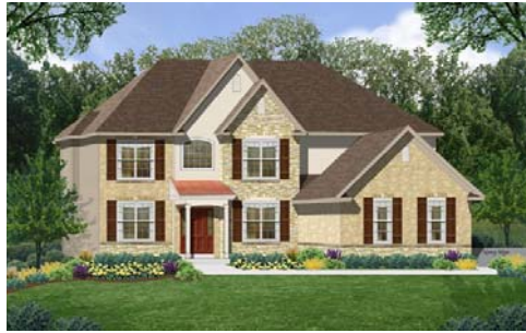
Maple - E • 3,859 sq. ft.