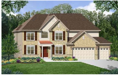
Gailsburg V - E • 3,859 sq. ft.