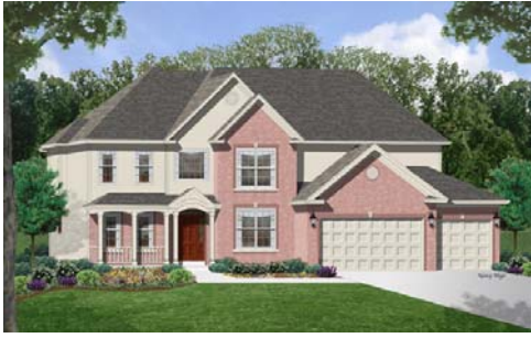
Gailsburg V - A • 3,851 sq. ft.