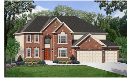
Gailsburg V - F • 3,902 sq. ft.