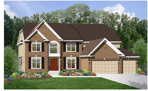
Gailsburg V - C • 3,950 sq. ft.