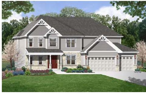
Gailsburg V - B • 3,908 sq. ft.