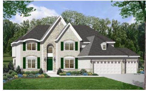
Gailsburg V - D • 3,903 sq. ft.