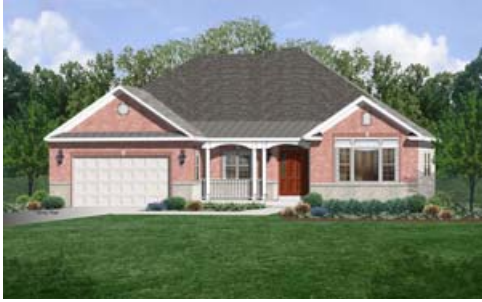
Evergreen II - A • 2,594 sq. ft.