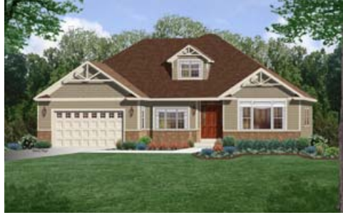
Evergreen II - B • 2,594 sq. ft.