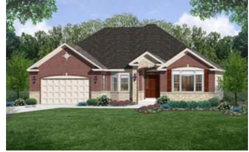
Evergreen II - C • 2,594 sq. ft.