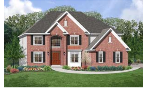
Cypress - C • 4,101 sq. ft.