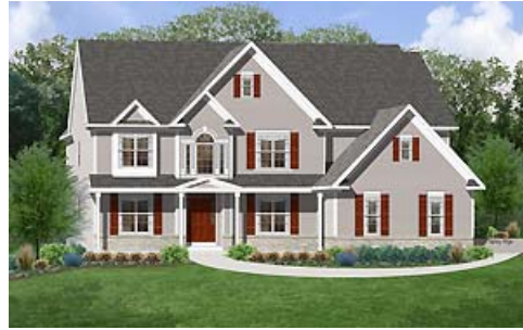
Cypress - B • 4,101 sq. ft.