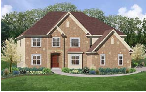
Cypress - A • 4,101 sq. ft.