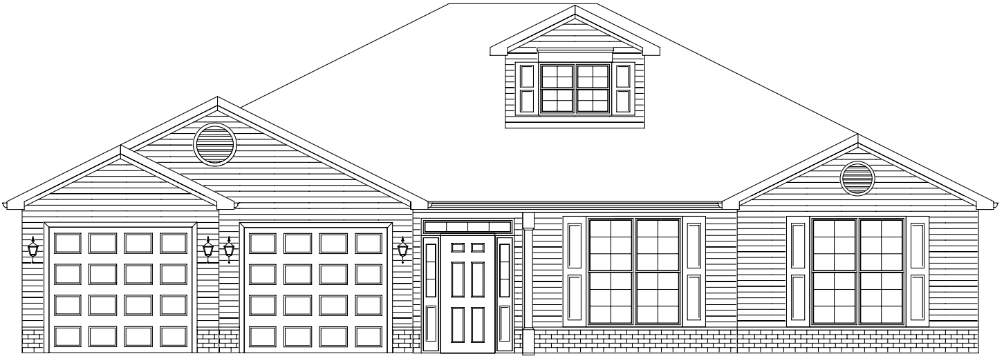
Chestnut II - A • 2,288 sq. ft.