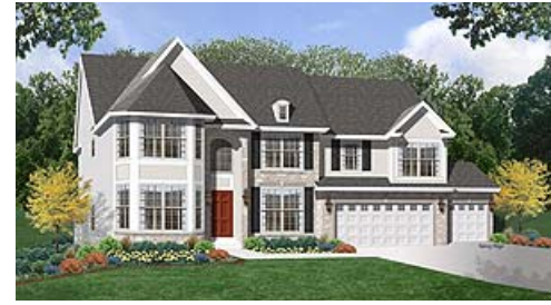
Birch II - F • 3,091 sq. ft.