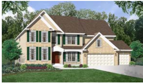
Birch II - B • 3,244 sq. ft.