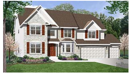
Birch II - C • 3,161 sq. ft.