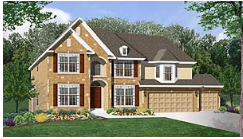
Birch II - E • 3,159 sq. ft.