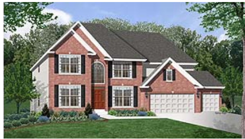
Birch II - D • 3,198 sq. ft.