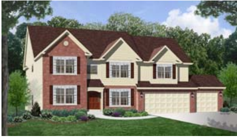
Birch II - A • 3,181 sq. ft.