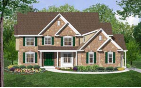
Aspen - A • 3,878 sq. ft.