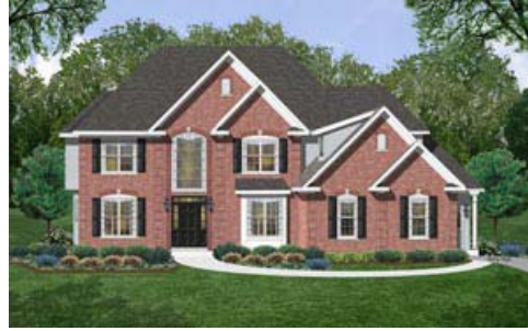
Aspen - B • 3,878 sq. ft.