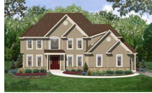
Aspen - C • 3,878 sq. ft.