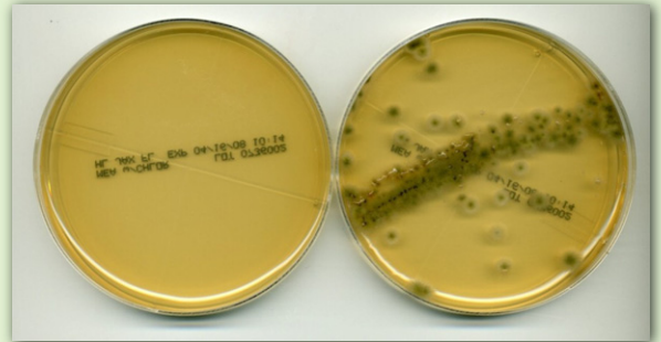
30 days after system was activated